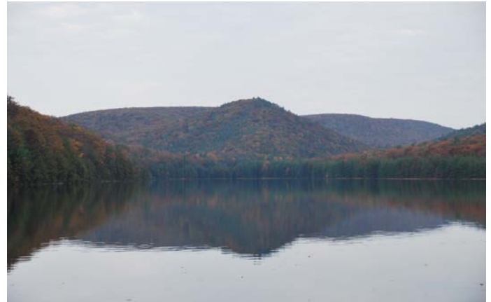
Figure 2: Long Pine Run Reservoir

These shut-downs generally last 12-20 hours; but have lasted as long as 30 hours. Fortunately we possess 2+ days of storage within our distribution system.