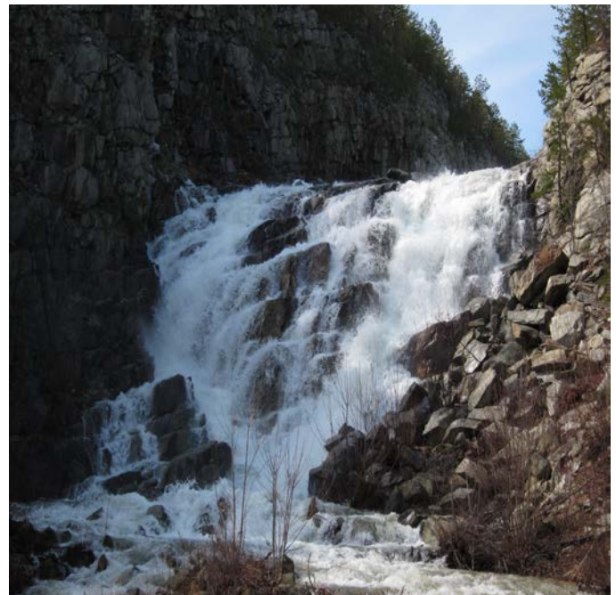
Figure 1: Long Pine Run Reservoir Spillway

Julio Lecuona Water Treatment Plant 7659 Lincoln Way East Fayetteville, PA 17222 Phone number: (717) 352-7450