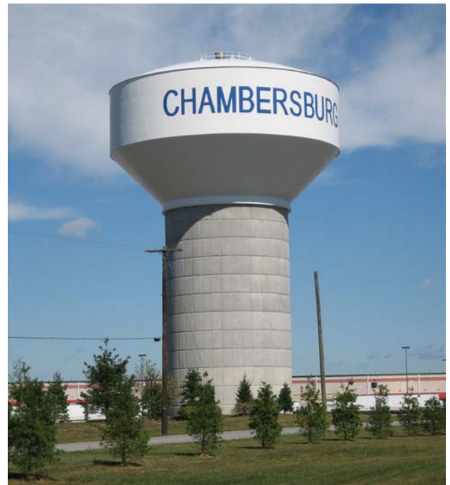
Figure 4: Nitterhouse Drive Elevated Tank