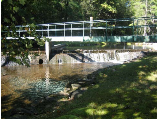
Figure 3: Conococheague Creek Intake Facility

those days. Potable water standards are much more stringent than they were 100+ years ago and continue to be improved upon.